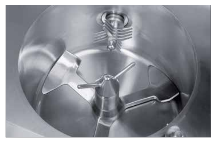
Mixing tools and chopper

A three-arm mixing impeller rotates close to the wall and bottom of the vertical, cylindrical mixing drum. The shape and peripheral speed of the impeller are coordinated in such a way that the product forms a vortex. This achieves short mixing times, excellent homogeneity and enables a buildup of granules. A separately driven chopper is used for adjusting and breaking up any excessively large agglomeration of product as well as for even moistening and granulation. Liquid addition is carried out with a pump or by gravity. The liquid is added into the mix right above the chopper which achieves best possible distribution. The optional wet sieve calibrates the wet granules while discharging from the mixer. Discharge can take place into a vessel or product can be transported pneumatically to a Fluid Bed Dryer.