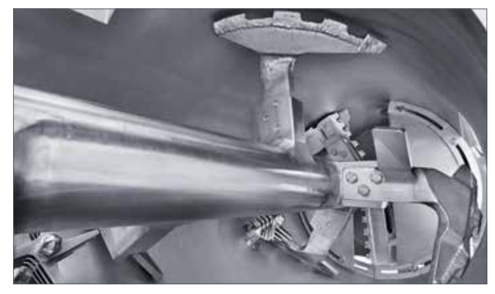
View inside mixing drum