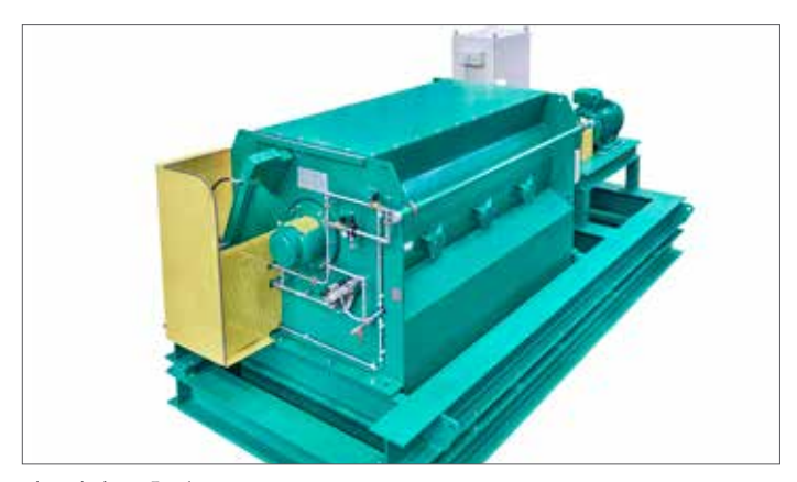
Ploughshare® Mixer type DBE 3000